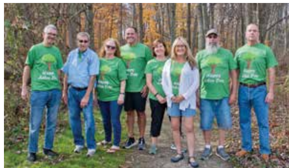
Members of the City of Avon Tree Commission.

To contact a member of the Commission, please send an email to Treecommission@cityofavon.com . It will be sent to the appropriate member for response.