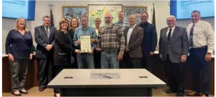
Avon City Council with proclamation from Mayor Jensen urging all Avon residents to celebrate Arbor Day.

Commission and supporting its initiative to apply for Tree City USA certification. The legislation also set aside a budget allocation to initiate and maintain a community forestry program.