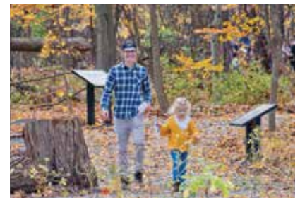
2022 Arbor Day Celebration