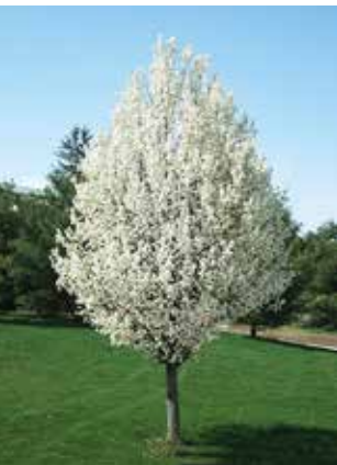
Bradford Pear (banned)