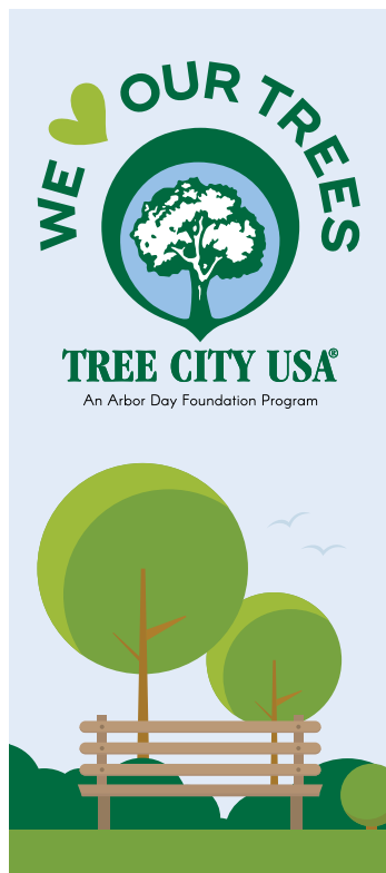
Tree City USA pole banner art.

Our committee is comprised of dedicated individuals who care deeply about our city and preserving the landscape of it. We have worked hard to have Avon recognized as a Tree City USA®. We even hosted our first Arbor Day celebration last fall. Please join us this fall for our 2 nd annual celebration on October 7 th . It will be even bigger than our first one.