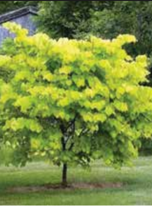
Hearts of Gold Red Bud (City of Avon Tree)